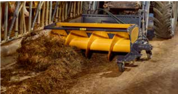
The floor of the feeding table is clean and constantly taken care of.