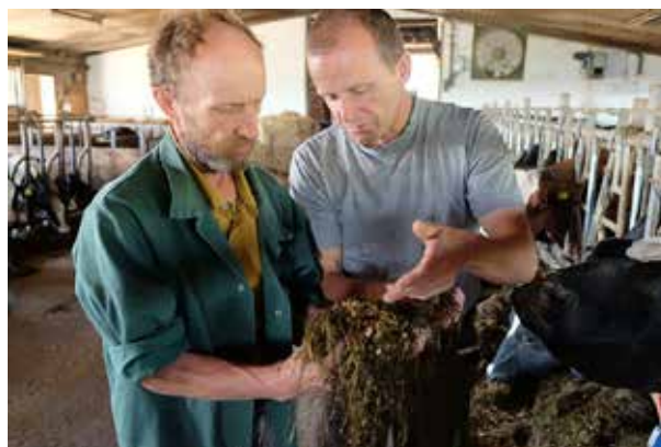
Constant mixing and aeration during feed pushing maintain the feed quality.

Studies have shown that more frequent pushing and aeration have a positive effect on the health and performance of the animals. It is possible to draw conclusions regarding the health of the animals from their feeding behaviour. Working with the FEED MASTER takes away the laborious manual work, although it remains possible to keep a constant eye on the herd.