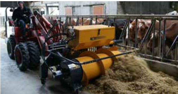
Using the concentrated feed container with the Fortuna (accessory) encourages the animals to consume a higher quantity of basic feed.