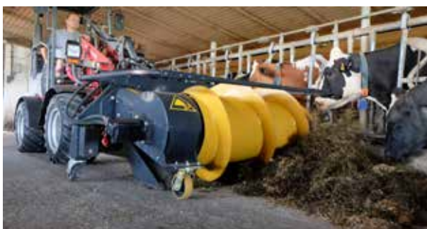
Fresh feed is attractive for cows: Loosening up during pushing increases the basic feed intake.