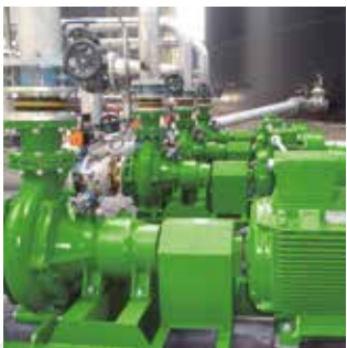
MAGNUM SX Thick matter pump gear and pedestal pump