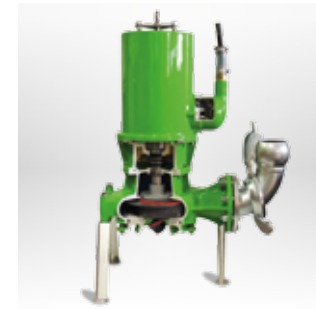
MAGNUM CSPH Submersible motor pump gear unit design