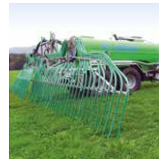
Trailing hose applicator Modular system for all types of tankers