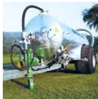
Slurry tankers and polyester tanker Different tanker types for every requirement