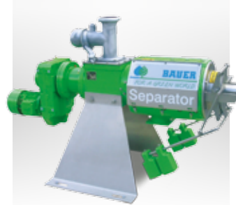
SEPARATOR Press screw separator for solid-liquid separation