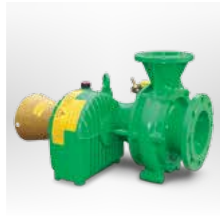
MAGNUM SM Thick matter pump gear unit design