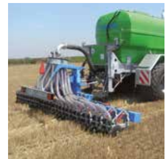
Slurry injector Innovative spreading technology