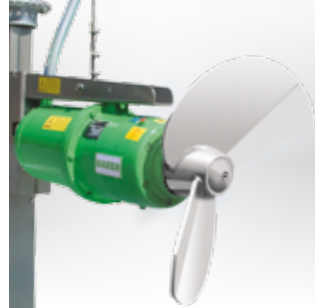
MSXH Submersible motor mixer