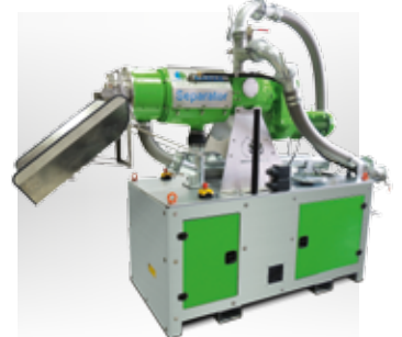
SEPARATOR PLUG & PLAY System for portable slurry separation