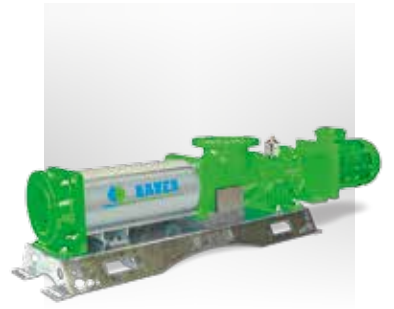
HELIX DRIVE Eccentric screw pump