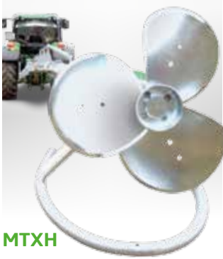
MTXH Tractor mixer