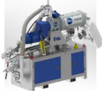
SEPARATOR PLUG&PLAY System for portable slurry separation