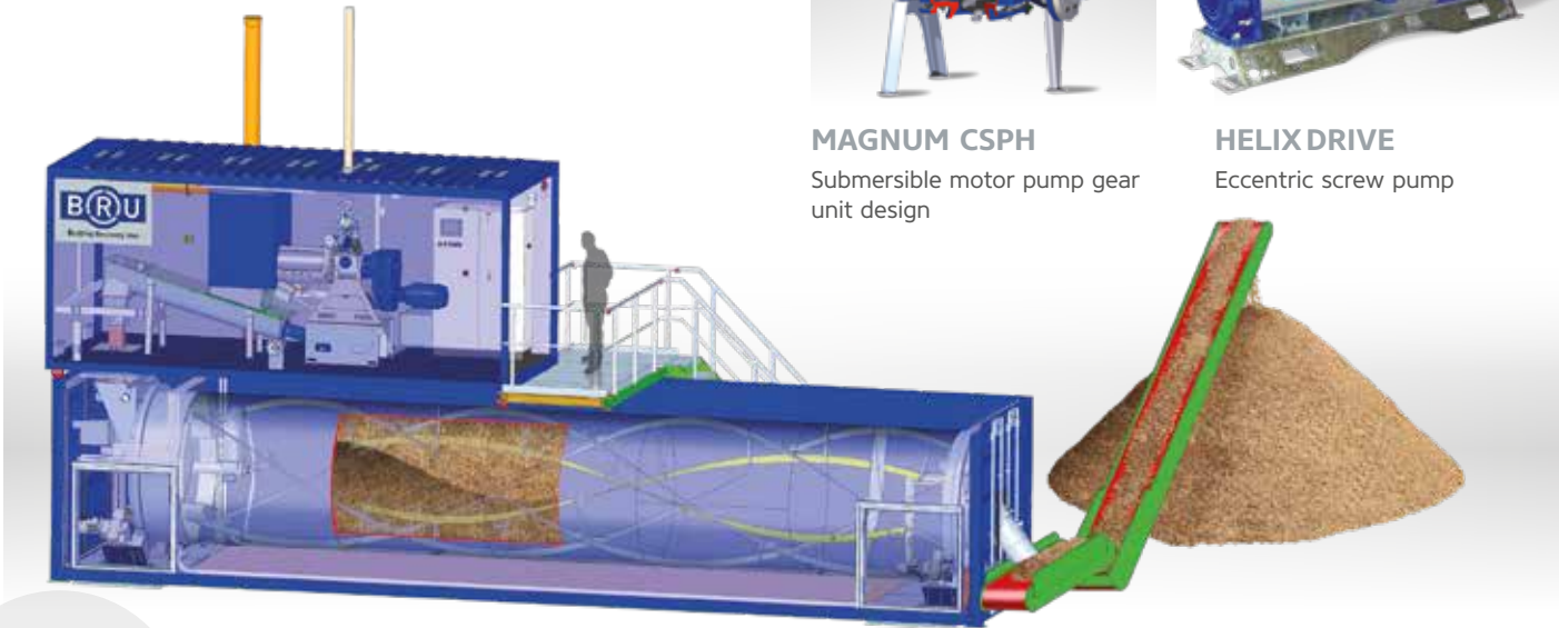
BRU Bedding Recovery Unit produces fresh bedding from slurry