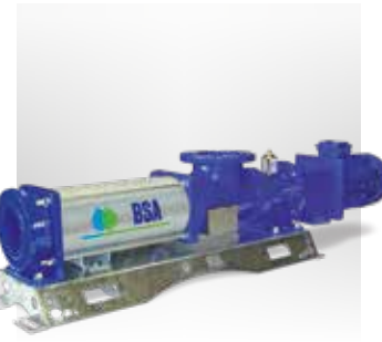
HELIX DRIVE Eccentric screw pump unit design