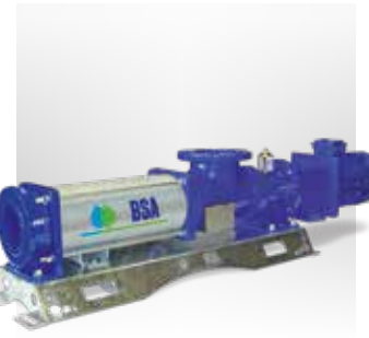
HELIX DRIVE Eccentric screw pump unit design