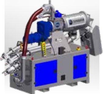
SEPARATOR PLUG & PLAY System for portable slurry separation