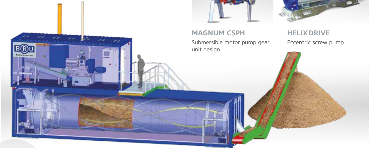
BRU Bedding Recovery Unit produces fresh bedding from slurry