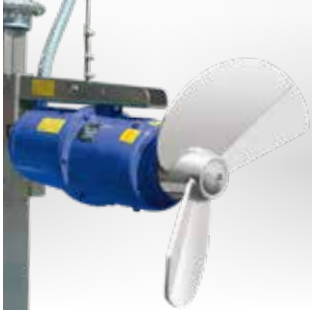
MSXH Submersible motor mixer