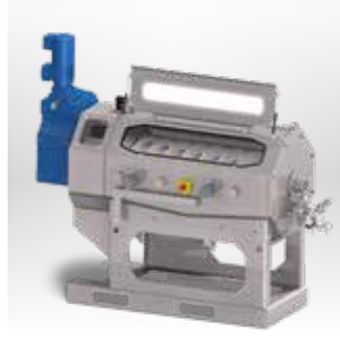
SEPARATOR SPS Sludge press for municipal and industrial waste water