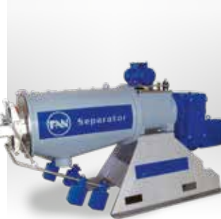
SEPARATOR PSS Press screw separator for solid-liquid separation